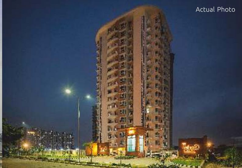
GALAXY HEIGHTS Sector 66-A, Mohali