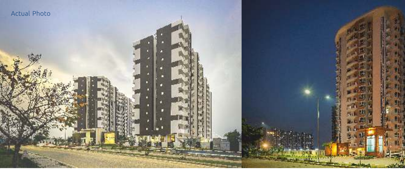
SKY GARDENS Sector 66-A, Mohali