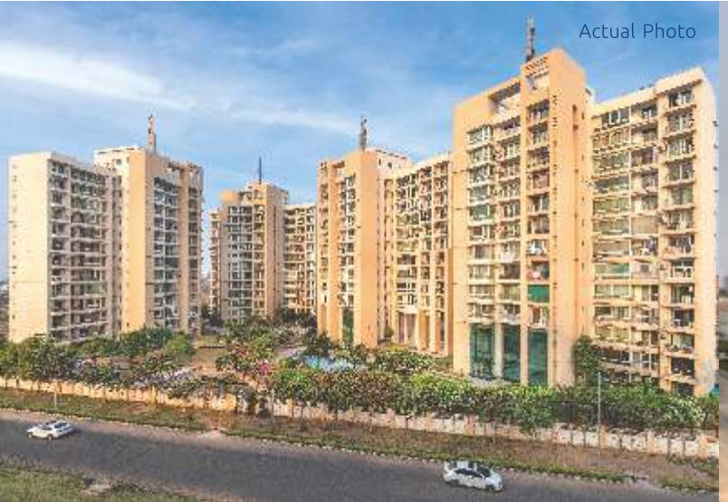
REGENCY HEIGHTS Sector 90, Mohali