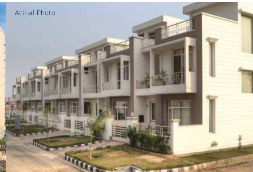
CANAL VIEW Ludhiana